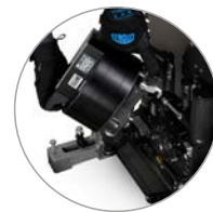
Tool-free motor fastening