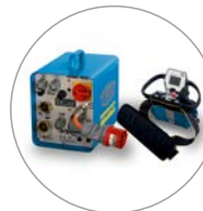
Compact and light control unit, handy remote control with display

The WSE1621 was developed for universal usage and the daily use on the construction site. Thanks to the digital features and the compact and light design, this newly developed system is setting new standards in wall sawing. Assembly and disassembly are done